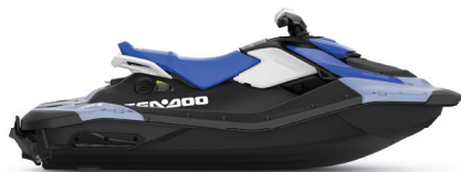
● NEW Dazzling Blue and Vapor Blue