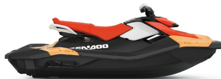
● NEW Sunrise Orange and Dragon Red